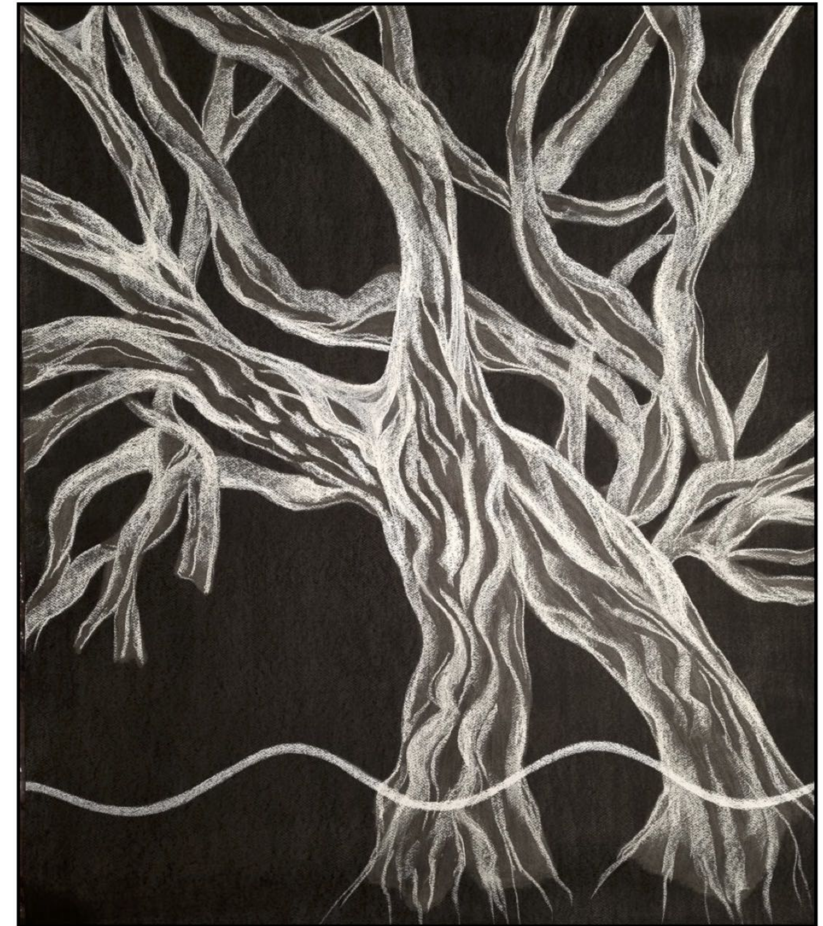
Sentience 2023 Charcoal on archival paper