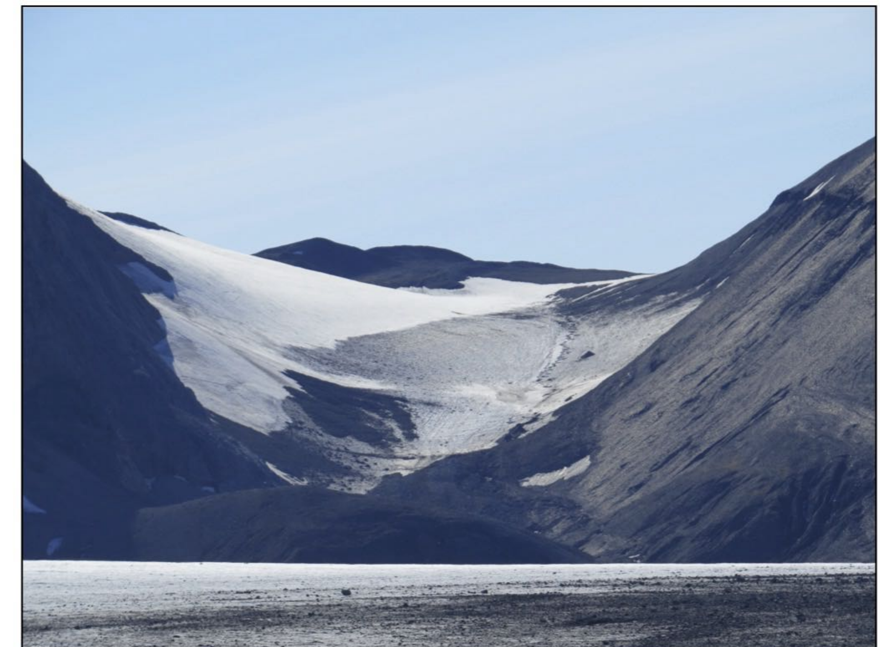
Svalbard – Recession (detail) 2014 Inkjet print

<< (far left) Ebb & Flow II 2023 Inkjet print