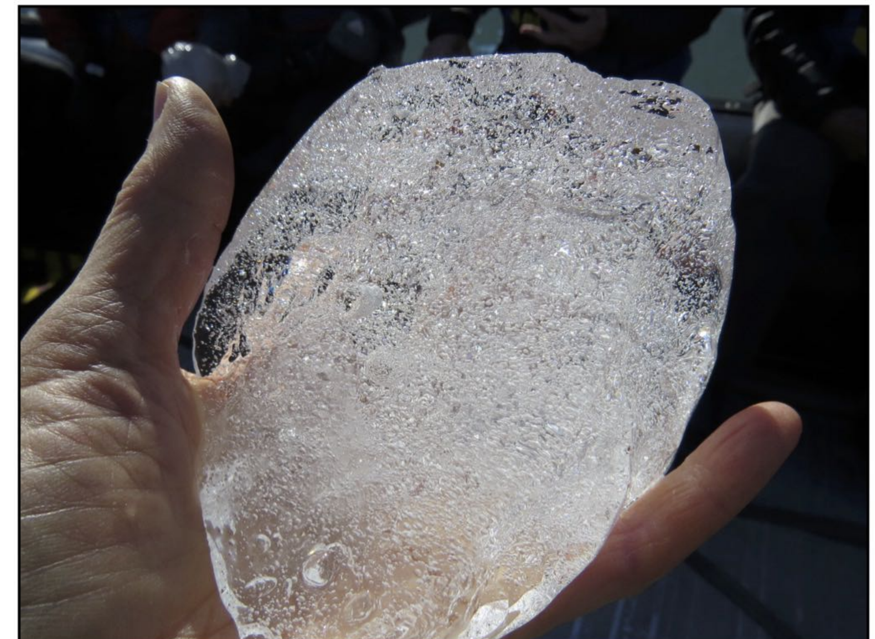
Svalbard - Recession (detail) 2014 Inkjet print